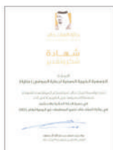
King Khalid for the Financial Standard and Investment