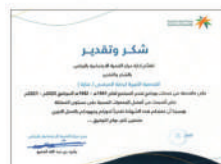
Certificate of Appreciation from the Ministry of Human Resources as the best health society